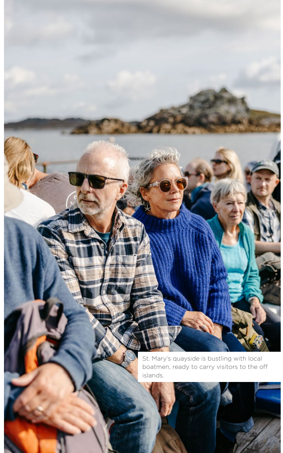
St. Mary's quayside is bustling with local boatmen, ready to carry visitors to the off islands.